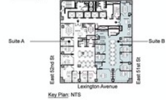
Key Plan: NTS