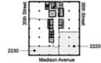
Key Plan: NTS