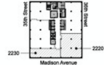
Key Plan: NTS