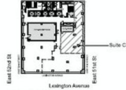
Key Plan: NTS