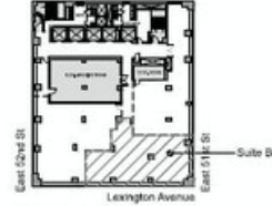
Key Plan: NTS

GEORGE COMFORT & SONS, INC Commercial Real Estate Since 1919