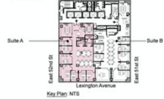
Key Plan: NTS